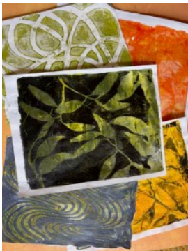
Below: Finished Collages