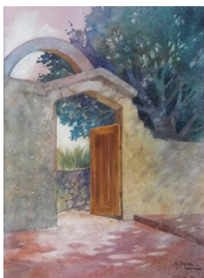
Realistic Watercolor from source photo

And then every so often, she creates a painting that is entirely abstract, with no identifiable imagery in it. This process is different from her realistic process, but as with realism, requires a strong foundation of design, along with intuitive decision making. Two very different ways of working, with two very different results!