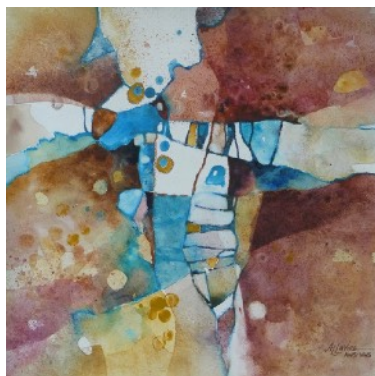
Abstract Watercolor from source photo