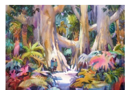
Day 2. Painting with Light

The most powerful visual tool we artists have is light. Don will show you how to manage, organize and manipulate light to your paintings advantage.