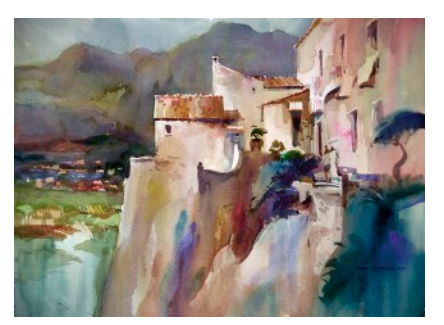
Day 1. Granulation Luminous granular washes make watercolor special as a medium. Don walks you through the

Don has been traveling across this country teaching watercolor workshops for over 40 years. His teaching style is traditional; he believes we learn to paint watercolor the way we learn anything else...with information and practice. Now technology has presented a wonderful new teaching opportunity for both students and teachers. Sign up for this online workshop!