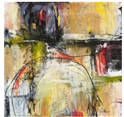
"Above the White Moon"

"I personally believe that creativity is not an inherited skill that is passed on genetically but is something that can be learned by changing old perceptions and habits. Everyone is creative. You just must find out where your creative bent leads you," Ted Matz