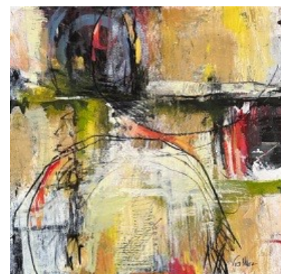
"Above the White Moon"

"I personally believe that creativity is not an inherited skill that is passed on genetically but is something that can be learned by changing old perceptions and habits. Everyone is creative. You just must find out where your creative bent leads you," Ted Matz