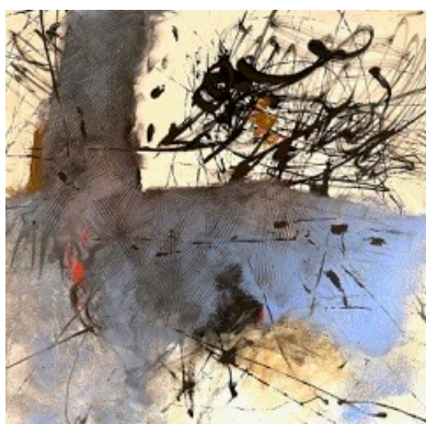
"Between Here and There"

You will learn simple techniques that will help loosen up your paintings regardless of your current style.